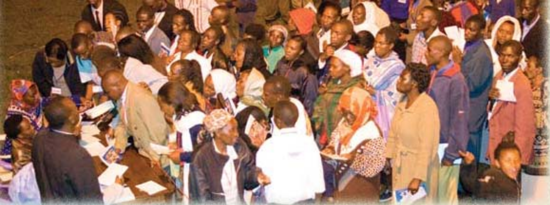
Counsellors fill in decision cards recording new decisions