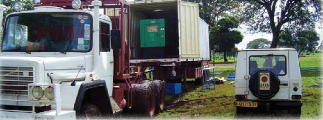
The 6 wheel drive truck can reach the remotest village.