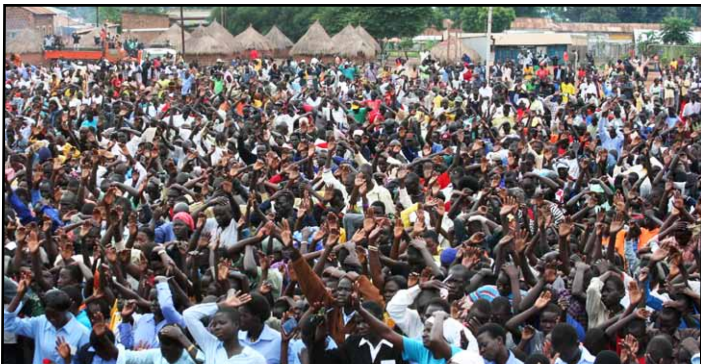
Yei South Sudan approximately 43,700 people hear and respond the Gospel

We will have all eternity to celebrate our victories, but only one short hour before sunset to win them [Robert Moffat].